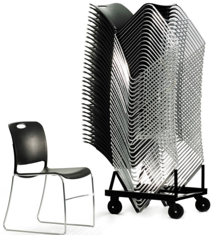
Safely stacks to 38 high on the Maestro transport dolly

NB: All dimensions quoted are approximate