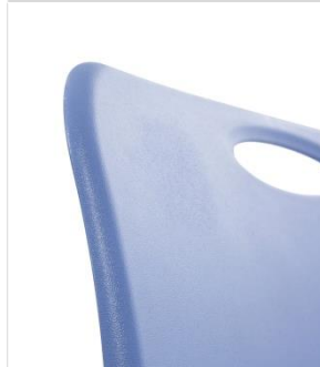
Integrated handle for easy movement