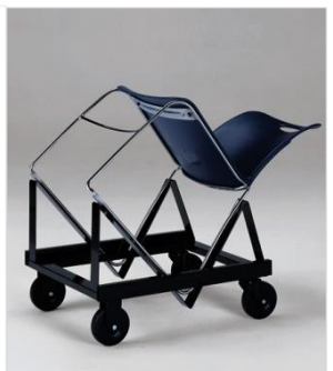
Transport dolly for easy movement of chairs