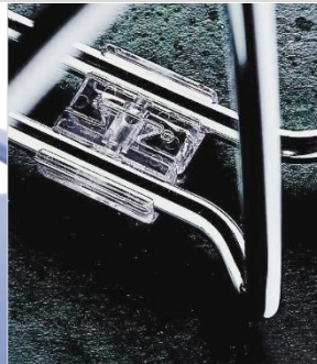
Option to link chairs with Lexan glides