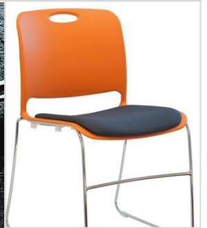
Seat pads in fabric or vinyl can be added