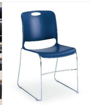
Finishes guide lists frame, tablet and upholstery options