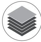
Stackable Meeting Chair