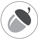
Solid Oak Frame