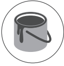
Choice of Colours