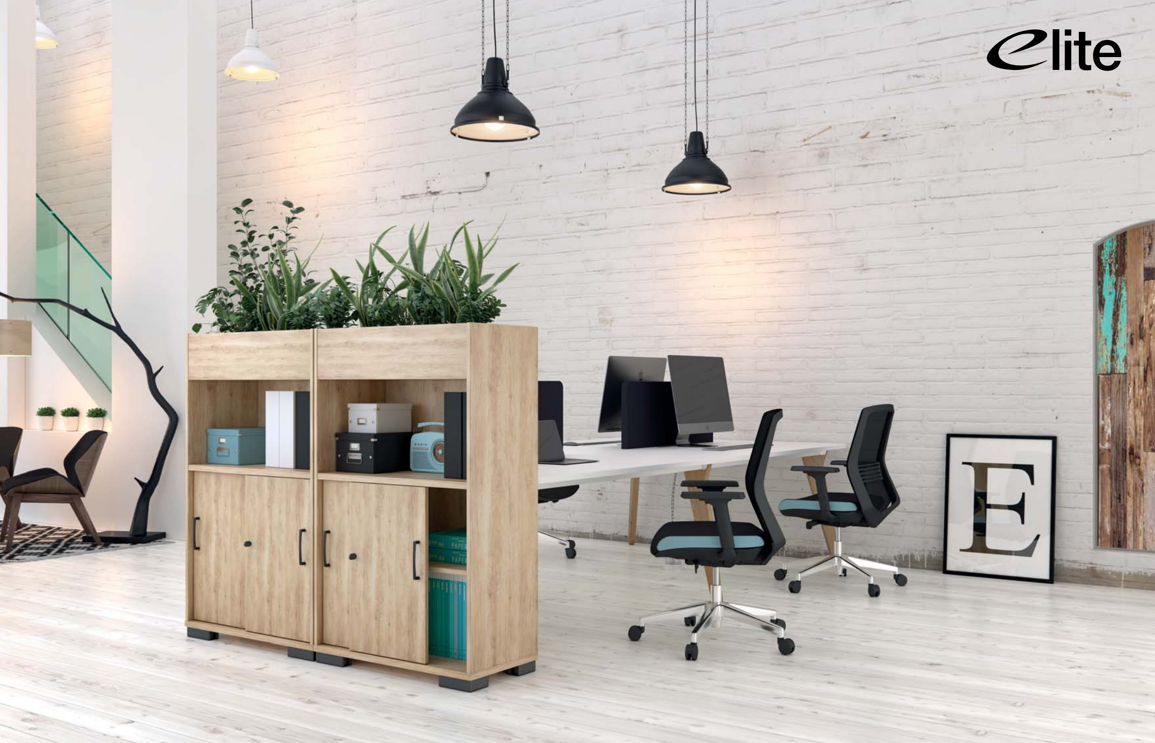
PLANTER STORAGE UNIT