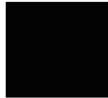
A - Black