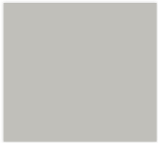
N3 - Pearl grey