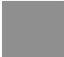
M - Metallic