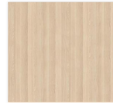
D3 - Sand Ash