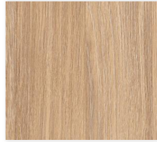
D2 - Amber oak