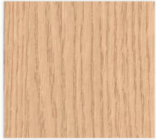
D1 - Whitened oak