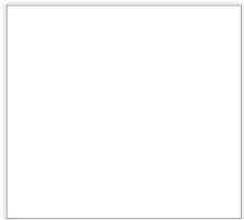
E - White