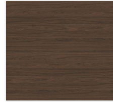
D4 - Dark walnut