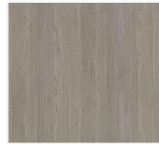
D5 - Grey wood