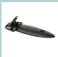
Fittings for desktop connection