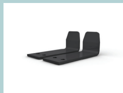
Linking parts (2 pcs.)