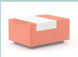
Metal table placed on the pouf (black or white colour)