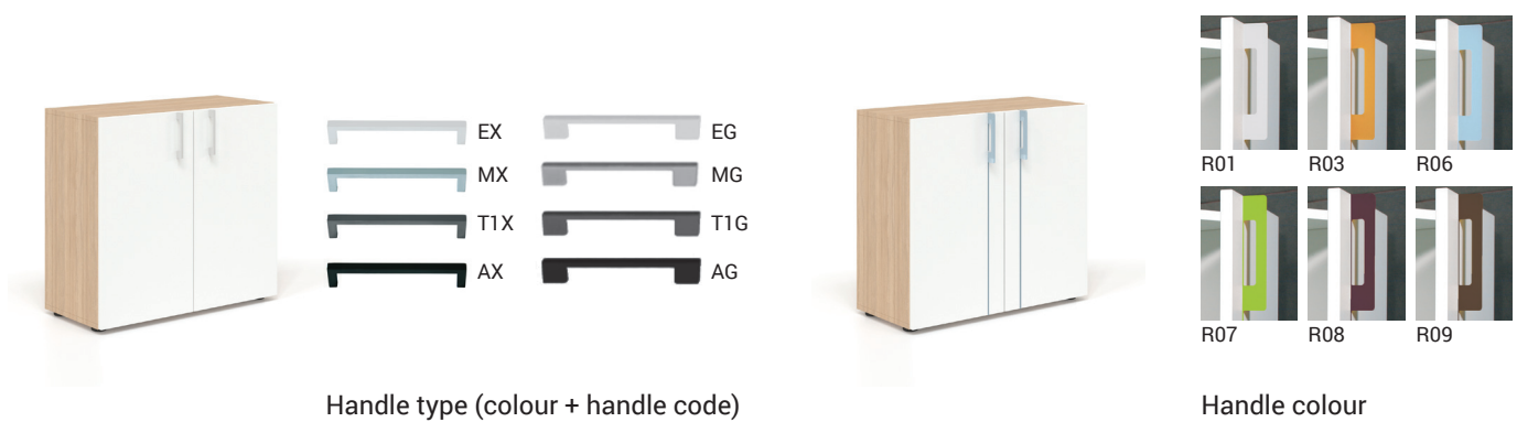
Handle type (colour + handle code)